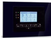
Last generation control panel